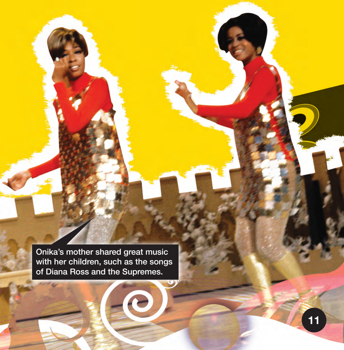
Onika's mother shared great music with her children, such as the songs of Diana Ross and the Supremes.

Onika's parents started going to church. Then her parents got back together. Onika was not as quick to forgive her father. She still worried about her mother. She wanted her mother to be strong enough to care for herself and her kids. So Onika kept dreaming of becoming rich so she could care for everyone. She even told her family that she would be a soap opera actress. She wanted to be rich and famous.