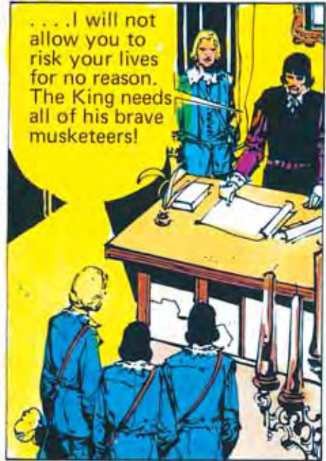
De Treville told the three men to go, then turned to d'Artagnan.