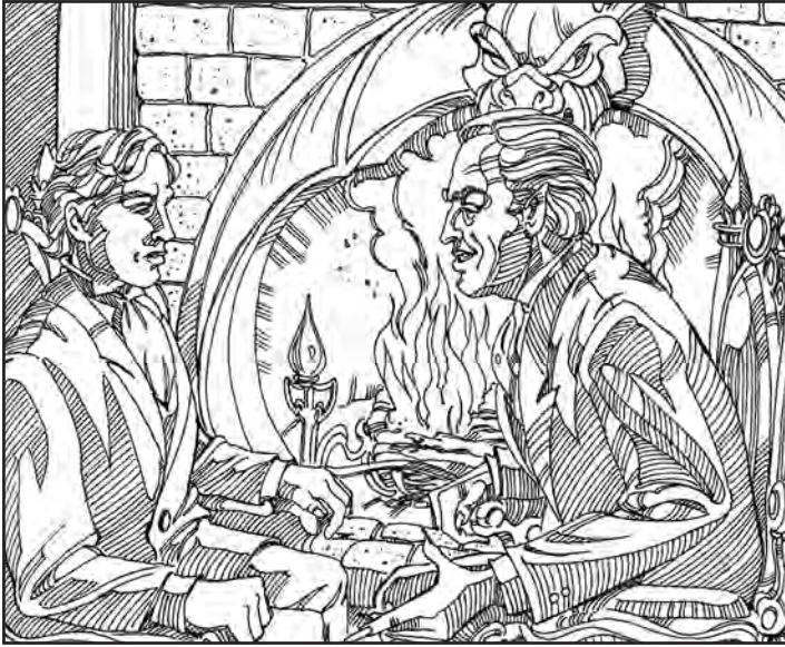
table was spread for supper. A fire was burning in the fireplace. He showed me another room right off this one. It was a welcome sight, for it was a large bedroom with another bright log fire.

“I pray you, sir, be seated and have something to eat. I won’t be eating with you, as I have dined already,” said my host.