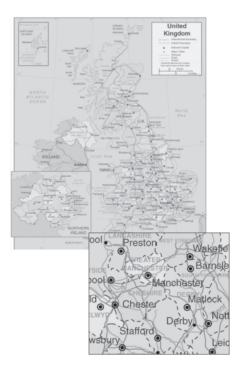
Hyde is in Cheshire County near Manchester, England.