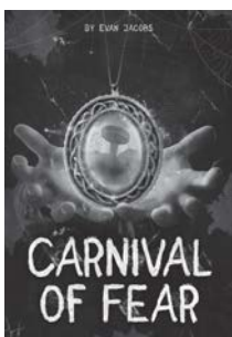
CARNIVAL OF FEAR 9781638890478