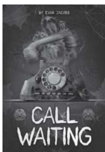
CALL WAITING 9781680217629