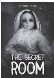
THE SECRET ROOM 9781680217582