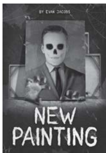
NEW PAINTING 9781680217612