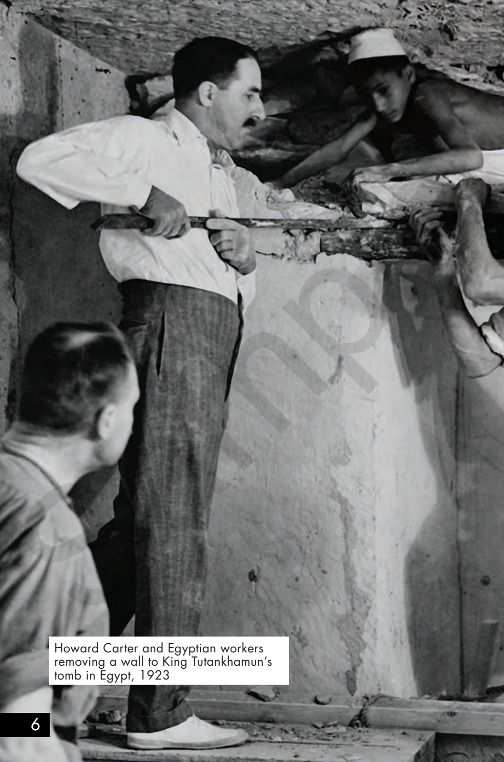
Howard Carter and Egyptian workers removing a wall to King Tutankhamun's tomb in Egypt, 1923