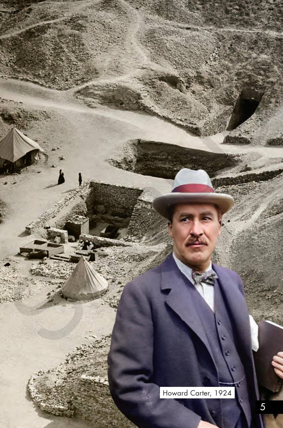
Howard Carter, 1924