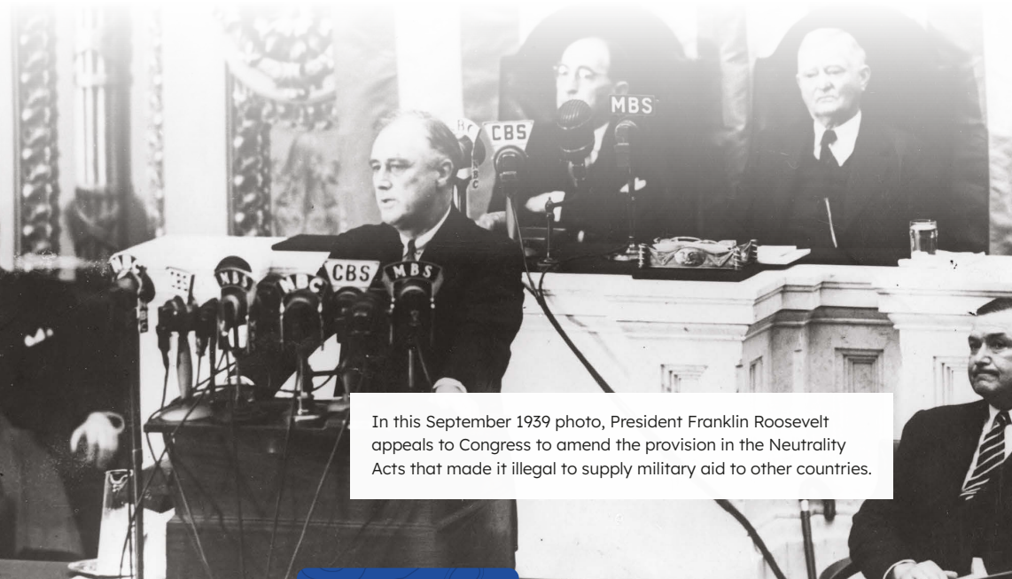
In this September 1939 photo, President Franklin Roosevelt appeals to Congress to amend the provision in the Neutrality Acts that made it illegal to supply military aid to other countries.

Still, the president looked for creative ways to aid the Allies. Britain needed destroyers . Roosevelt sent 50 old Navy ships. In return, Britain let the U.S. use several of its military bases.