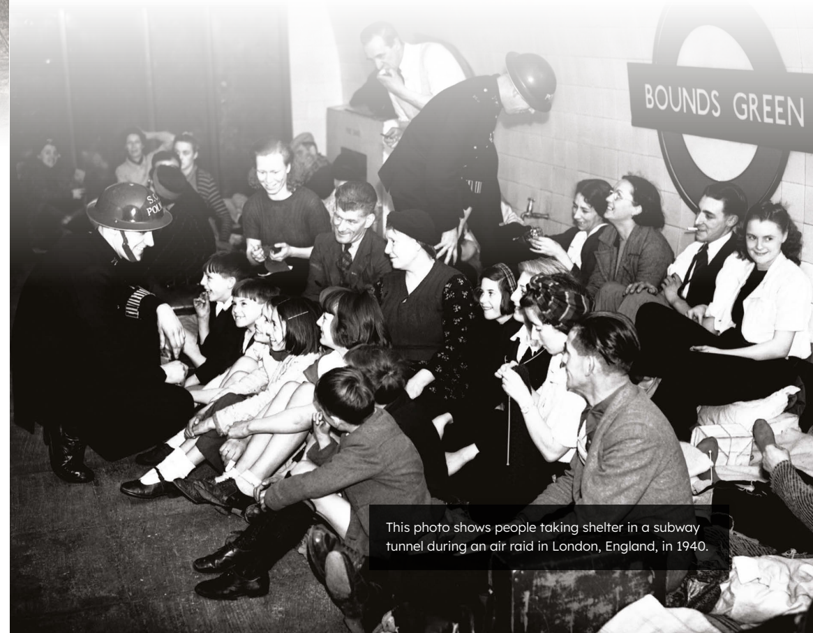
This photo shows people taking shelter in a subway tunnel during an air raid in London, England, in 1940.

Winston Churchill was Britain's prime minister. He made a speech. In it, he issued a warning about what might happen if Britain fell to Germany. "If we fail," Churchill said, "then the whole world, including the United States, . . . will sink into the abyss of a new Dark Age."