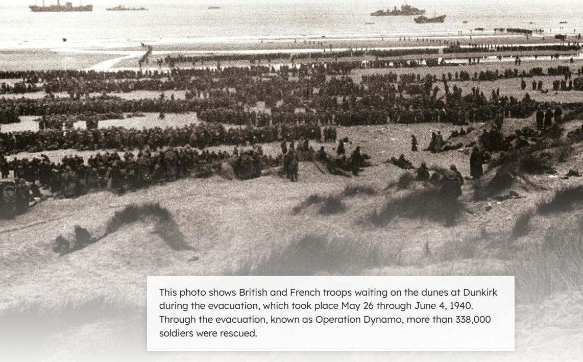
This photo shows British and French troops waiting on the dunes at Dunkirk during the evacuation, which took place May 26 through June 4, 1940. Through the evacuation, known as Operation Dynamo, more than 338,000 soldiers were rescued.

Then boats began to arrive. Some were military ships. Many were not. There were fishing boats and private yachts. They had come from Britain. These boats rescued thousands of Allied troops.