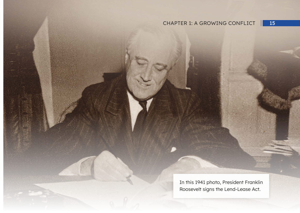
In this 1941 photo, President Franklin Roosevelt signs the Lend-Lease Act.

In 1941, Congress passed the Lend-Lease Act. Under the act, the U.S. wouldn't sell military supplies to warring countries. But it could let those countries borrow or rent the items. This aid just had to support America's defense. These terms helped the U.S. stay neutral.