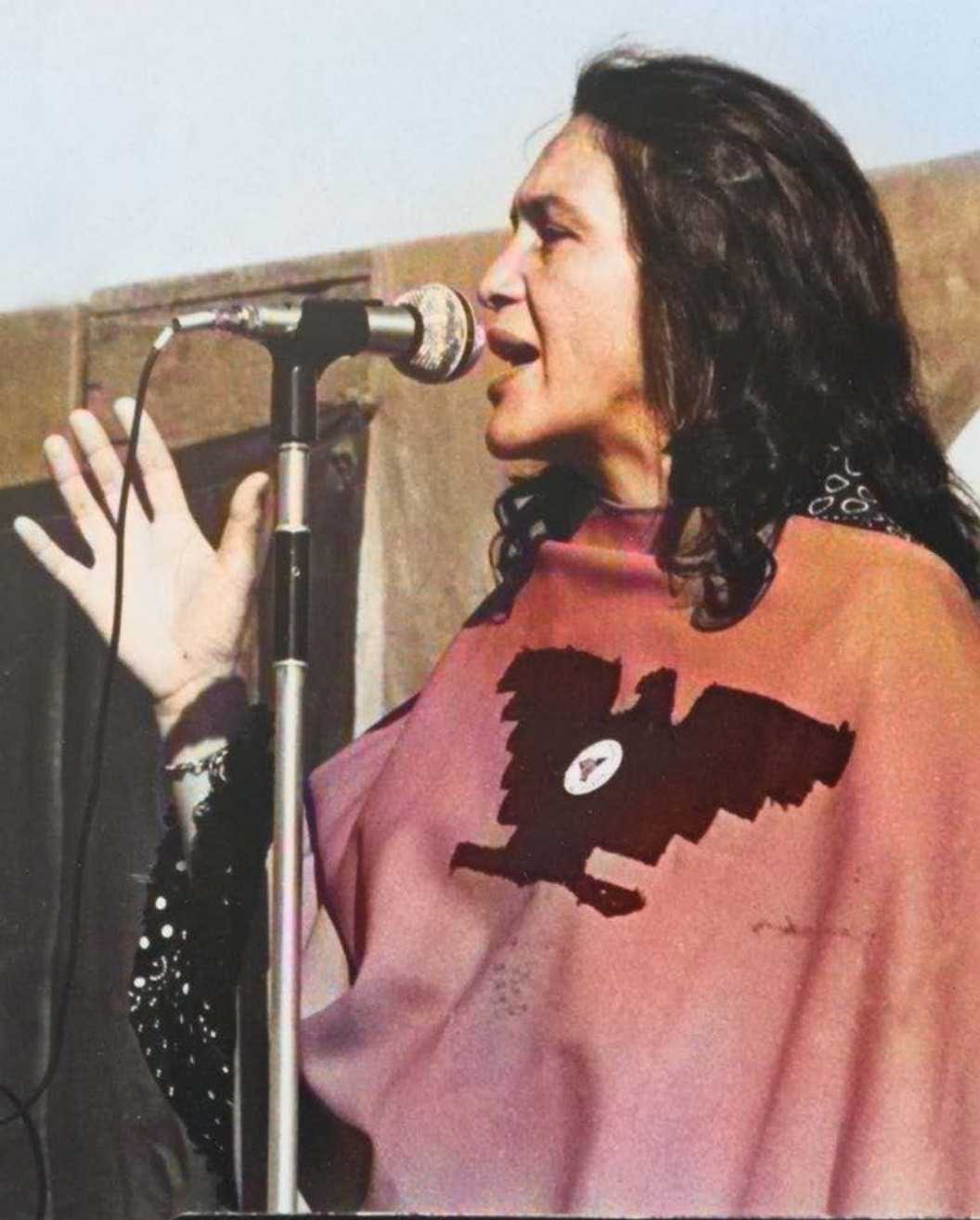
During the 1970s, Dolores Huerta spoke at many rallies in California to organize farm workers.