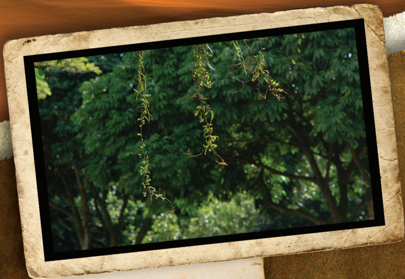
A CLOSER LOOK