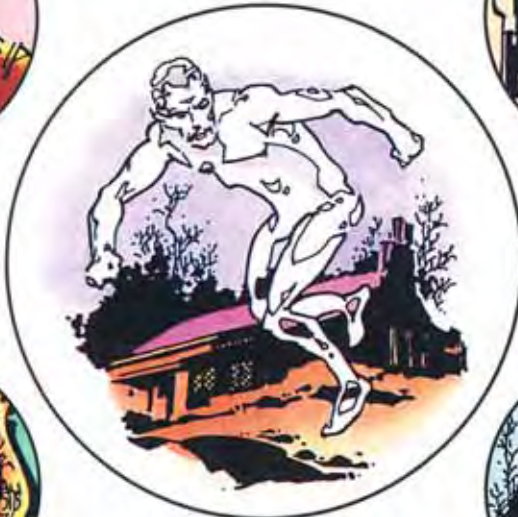
The Invisible Man