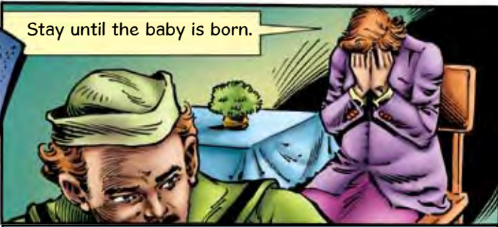
John Lennon was born in October 1940. His father came and went from his life frequently.

John went to live with his aunt and uncle when he was about 5 years old.