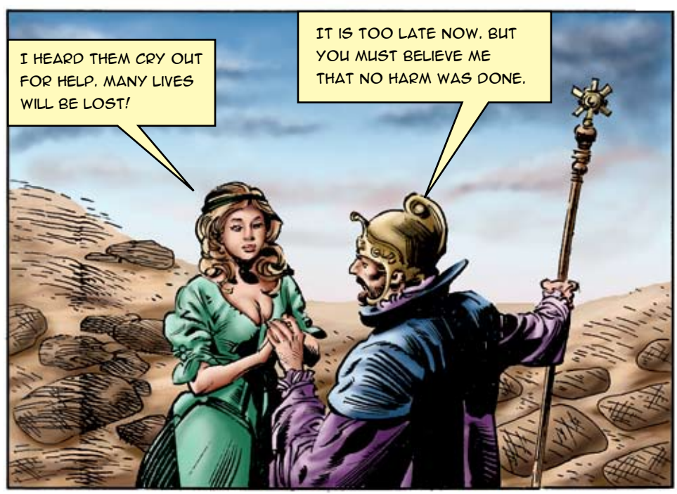
* a man who has studied magic and knows how to work with it